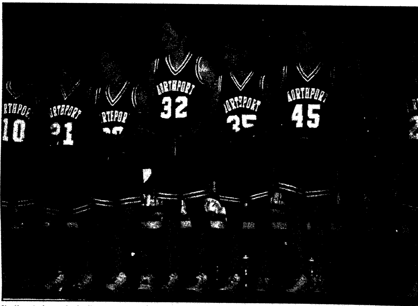
Northport players lock elbows and pray for a miracle that wouldn't happen as the final minutes tick away in a losing effort against Longwood last Friday.

"I have a nice group of kids coming back so I'm looking forward to that," he said.